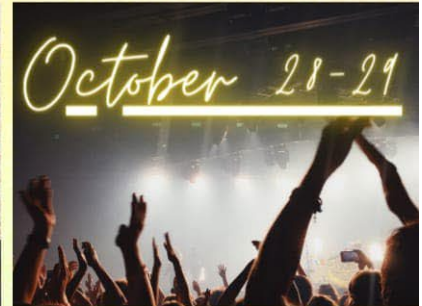
Local Artists & Community Members